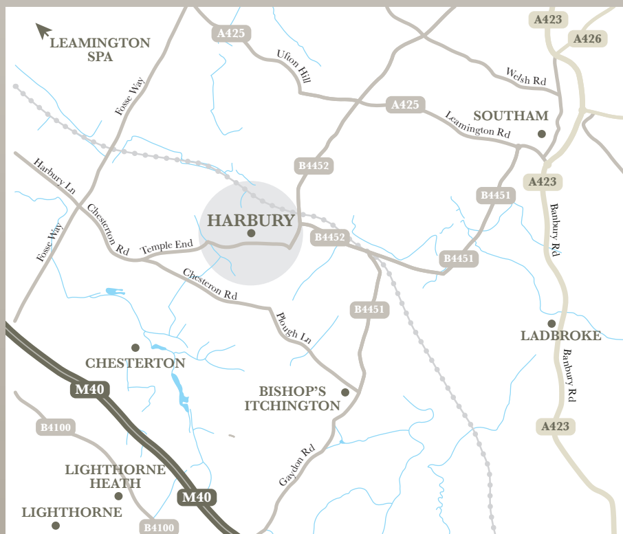
AREA MAP | MAP NOT TO SCALE