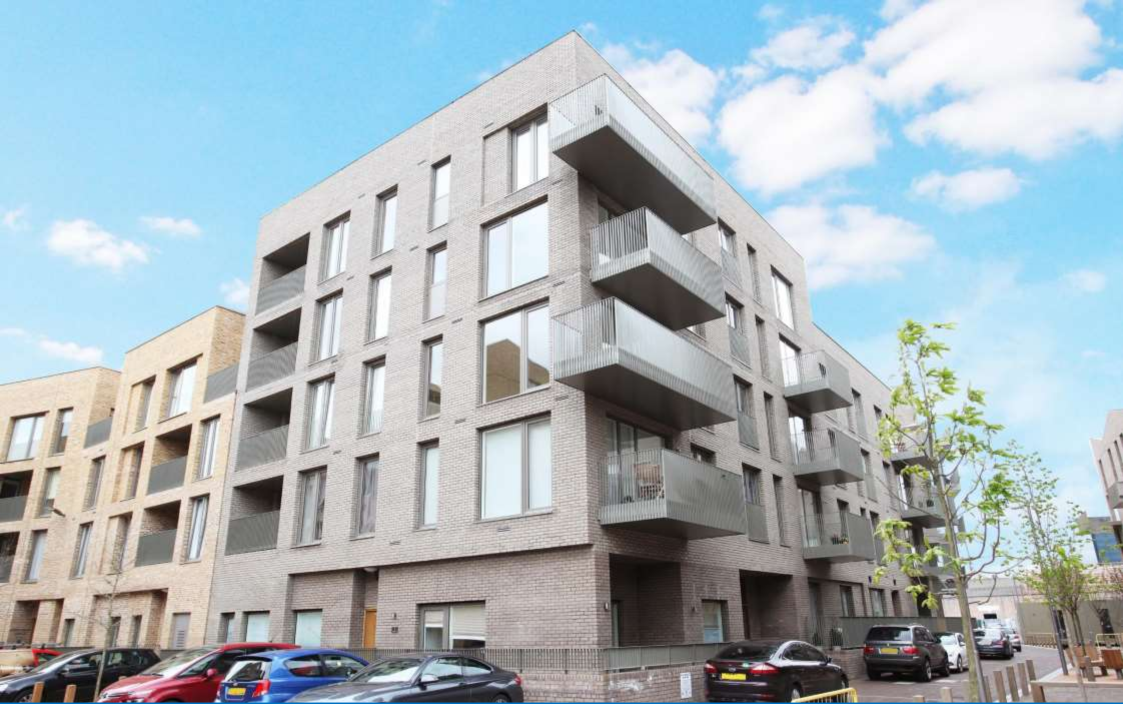
Bowline Court, Brentford, TW8