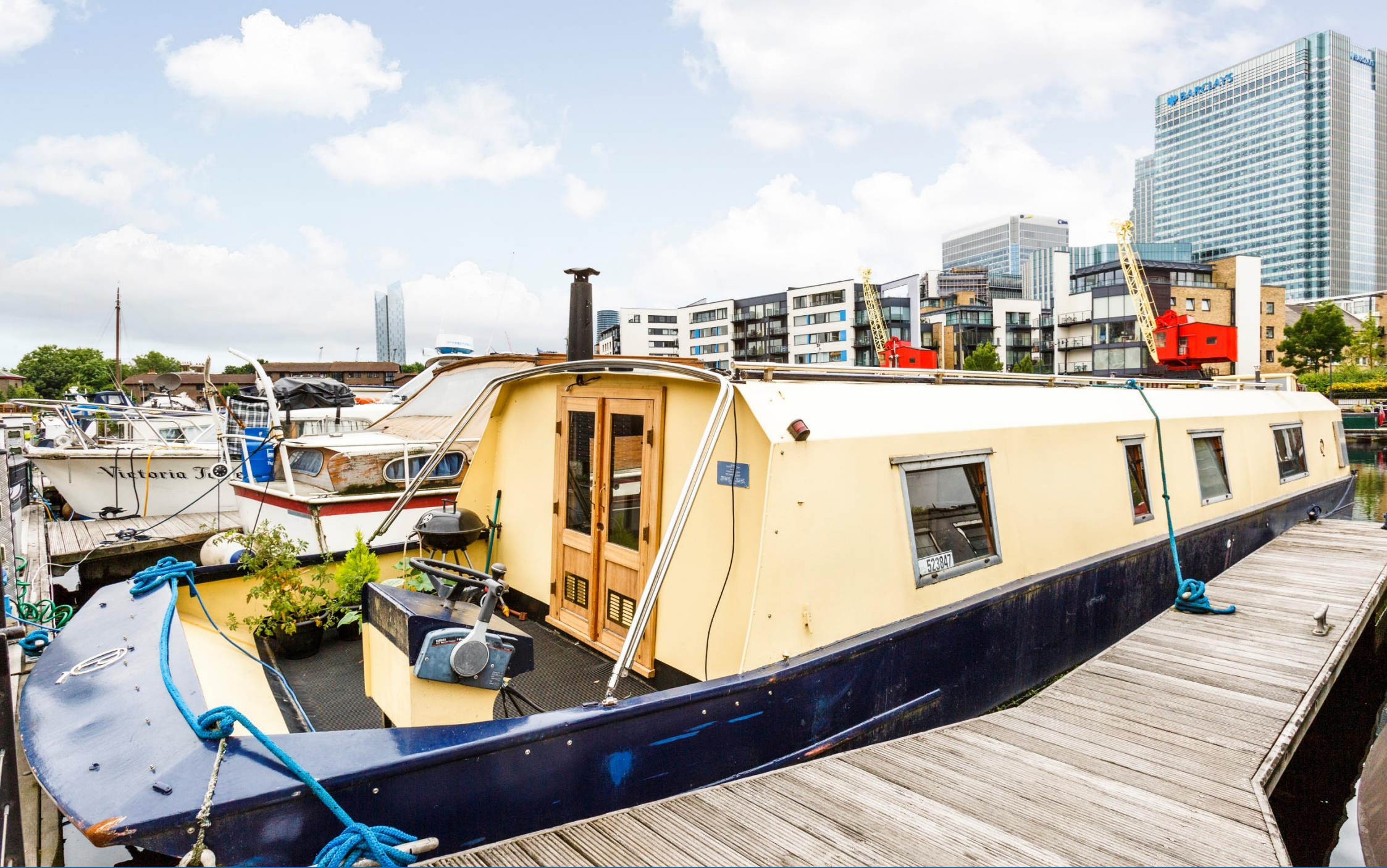
Poplar Dock Marina, Docklands, E14