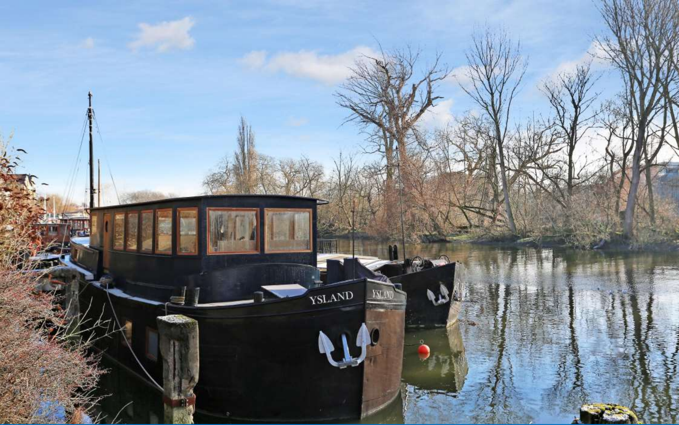
Victoria Steps Quay, Brentford, TW8